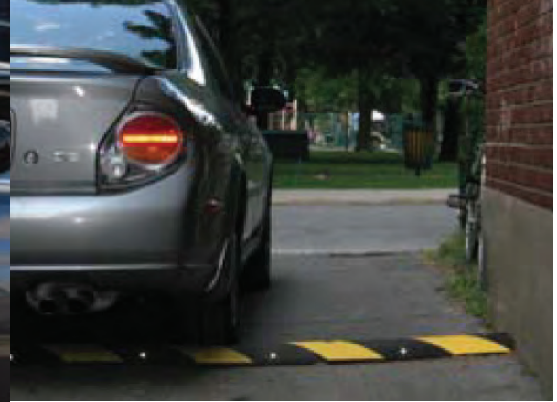
PICTURED: SPEED BUMP

Checkers™ is a full-service manufacturer of parking lot safety solutions. We design and manufacture traffic control products that help cars navigate and park safely. Our main goal has been to create solutions that protect motorists and pedestrians from the perils of today's parking lots. As such, Checkers™ products have been designed and developed with speed reduction, driver and pedestrian safety in mind. All our solutions are manufactured from 100% recycled rubber and plastic. Our speed bumps or parking blocks, for example, are longer lasting, highly visible, and more car-friendly than asphalt or concrete alternatives. Not only are Checkers™ traffic safety solutions environmentally friendly, they can also be installed for either temporary or permanent use.