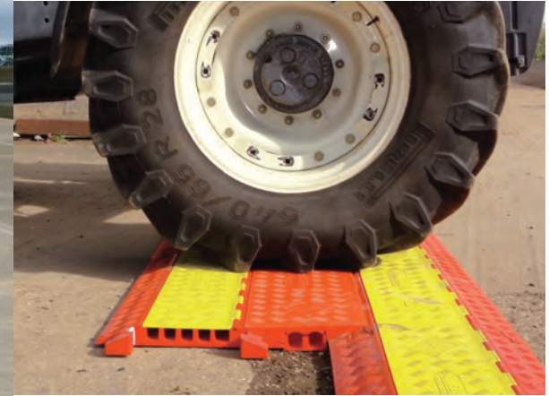
PICTURED: CL2X150-GD IN USE (LEFT) CL2X150-4/5 IN USE (TOP)

Checkers' Linebacker Cable Management offers the most extensive line of high performance cable/hose protection products in the world. These durable cable protection systems provide a safer method of passage for pedestrian traffic, vehicles and heavy duty equipment while protecting valuable electrical cables, cords and hose lines from damage.