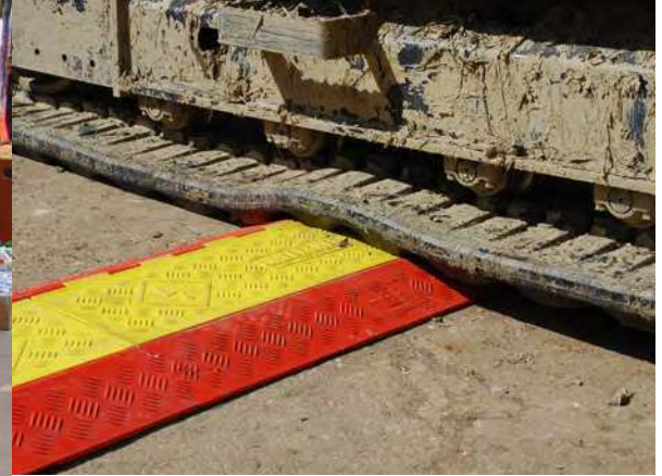
PICTURED: CP5X125 IN-USE (LEFT) CP5X125 IN USE (TOP)

Checkers™ Cable Management offers the most extensive line of high performance cable/hose protection products in the world. These durable cable protection systems provide a safer method of passage for pedestrian traffic, vehicles and heavy duty equipment while protecting valuable electrical cables, cords and hose lines from damage.