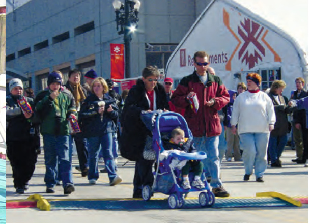
PICTURED: CPRP AND CPRL IN USE

Checkers™ Cable Management offers the most extensive line of high performance cable/hose protection products in the world. These durable cable protection systems provide a safer method of passage for pedestrian traffic, vehicles and heavy duty equipment while protecting valuable electrical cables, cords and hose lines from damage.