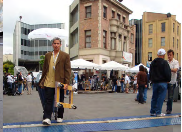
PICTURED: CPRP-3 IN USE

Checkers™ Cable Management offers the most extensive line of high performance cable/hose protection products in the world. These durable cable protection systems provide a safer method of passage for pedestrian traffic, vehicles and heavy duty equipment while protecting valuable electrical cables, cords and hose lines from damage.