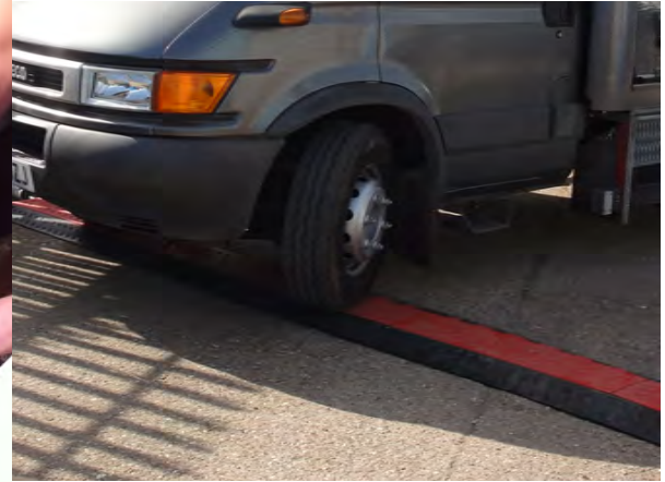
PICTURED: GD5X125 IN USE (LEFT) GD3X225 IN USE (TOP)

Checkers™ Cable Management offers the most extensive line of high performance cable/hose protection products in the world. These durable cable protection systems provide a safer method of passage for pedestrian traffic, vehicles and heavy duty equipment while protecting valuable electrical cables, cords and hose lines from damage.