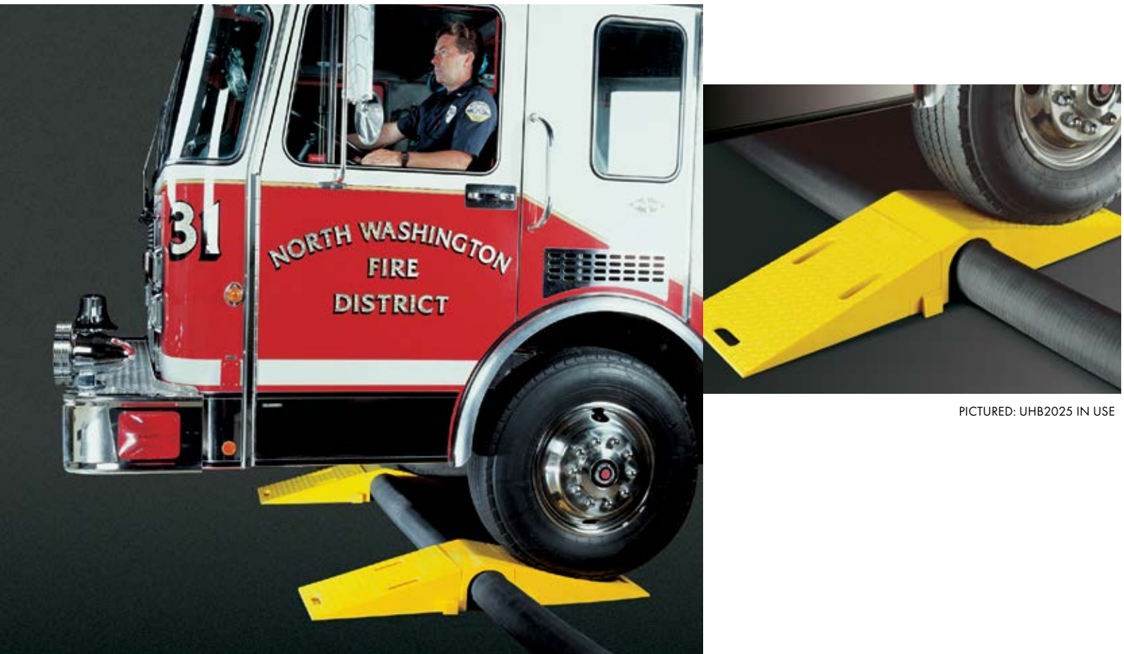
PICTURED: UHB2025 IN USE

Checkers™ cable management offers the most extensive line of high-performance cable/hose protection products in the world. These durable cable protection systems provide a safer method of passage for pedestrian traffic, vehicles and heavy-duty equipment while protecting valuable electrical cables, cords and hose lines from damage.