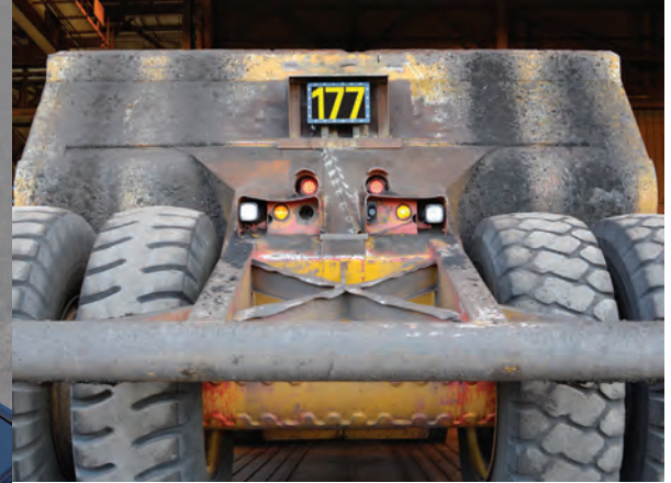
PICTURED: LUN SIGN IN USE

CHECKERS™ Vehicle Identification Signs provide fast and easy identification of any type of equipment in mining, construction, industrial, utility, or traffic work environments. Available in both small and large sizes, these identification signs are great for either small utility vehicles or haul trucks and larger equipment. Durable and highly visible, these signs will stand up to the abuse of a jobsite while providing optimal light output.