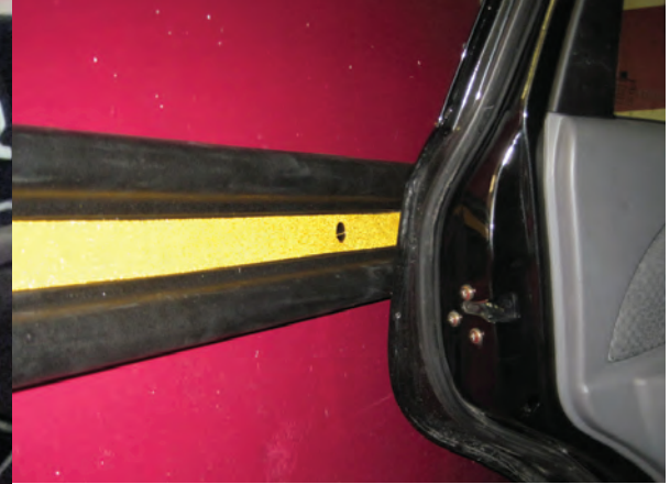
PICTURED: WALL GUARD AND CORNER GUARD

Checkers™ is a full-service manufacturer of parking lot safety solutions. We design and manufacture traffic control products that help cars navigate and park safely. Our main goal has been to create solutions that protect motorists and pedestrians from the perils of today's parking lots. As such, Checkers™ products have been designed and developed with speed reduction, driver and pedestrian safety in mind. All our solutions are manufactured from 100% recycled rubber and plastic. Our speed bumps or parking blocks, for example, are longer lasting, highly visible, and more car-friendly than asphalt or concrete alternatives. Not only are Checkers™ traffic safety solutions environmentally friendly, they can also be installed for either temporary or permanent use.