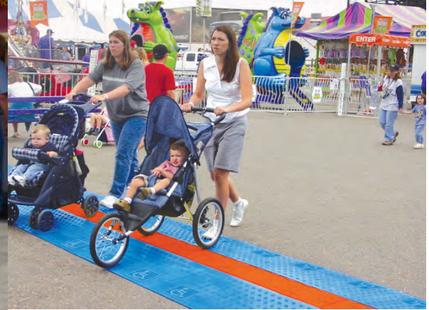
PICTURED: GD5X125-ADA IN USE

Checkers™ Cable Management offers the most extensive line of high performance cable/hose protection products in the world. These durable cable protection systems provide a safer method of passage for pedestrian traffic, vehicles and heavy duty equipment while protecting valuable electrical cables, cords and hose lines from damage.