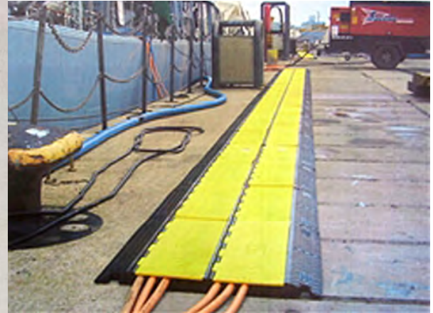
PICTURED: WSA-125-KIT3-HS IN USE

Checkers™ Cable Management offers the most extensive line of high performance cable/hose protection products in the world. These durable cable protection systems provide a safer method of passage for pedestrian traffic, vehicles and heavy duty equipment while protecting valuable electrical cables, cords and hose lines from damage.