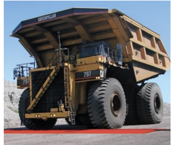
400-ton haul truck drives over an Extreme Crossover Pad

WARNING: Crossover pads are for rubber-tired vehicles only and are not for equipment with metal tracks.